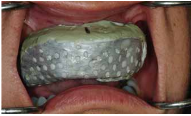
Figure 14: Silicone matrix in place for fabrication of temporary veneers from Bisacryl resin