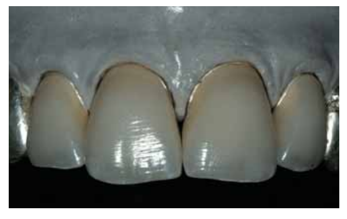
Figure 18: Final veneers. Note detailed, natural morphology, texture and characterisation

cementation and seemed to be made apparent by the camera flash. The patient was recalled and the crack was pointed to her on the photos. Even at this time, despite the knowledge of the crack is was not noticeable with direct vision and as such, it was decided to leave the veneer in place.