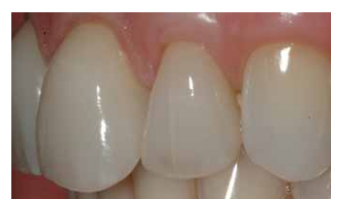
Figure 32: Post-bonding crack on left lateral incisor

white subjects. J Prosthet Dent. 2003 May;89(5):453-61.