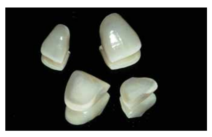
Figure 19: Final veneers. Note detailed morphology, texture and characterisation

Magne et al (1999) have proposed that a possible cause of this is a ceramic to luting is well bonded onto the underlying enamel a post bonding cracks does not jeopardise the longevity of the veneer and if the crack is not an aesthetic concern, the veneer should be left in place (Barghi and Berry, 1997). If the crack is obvious and detracts from the appearance, it is then necessary to remove and remake the veneer.