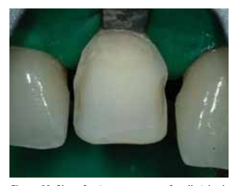
Figure 23: Clean frosty appearance of well etched enamel