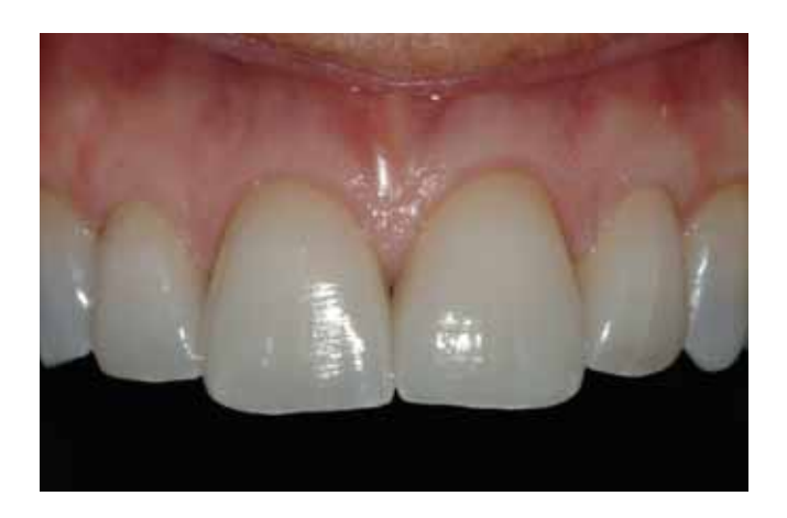
Figure 28: Final veneers bonded in place

Based on literature it appears that if the veneer precision. This ensures minimal damage to tooth and gingivae and enures optimal longterm prognosis. Despite following all precautions, because of the delicate nature of porcelain veneers, a possible post-operative complication is cracking. If the veneer has been well bonded to the underlying enamel and is not an aesthetic concern, the patient should be informed and the veneer should be left in place.