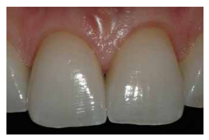
Figure 27: Final veneers bonded in place