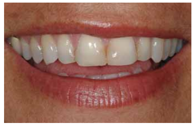
Figure 1. Pre-op smile