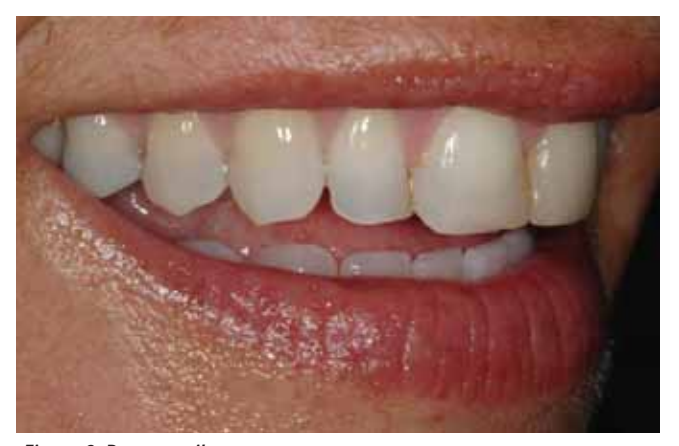
Figure 2. Pre-op smile

Two options were available to address this issue: