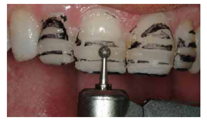
Figure 11: Use of depth cutting burs through Bis-acryl mock up

diastema between them. This also allowed for the changing of the tooth widths in the final restorations. Following tooth preparation, the final impression was made. Even though the preparation margins were at the level of the gingival margins, a retraction cord was used to allow an impression of the tooth surface beyond the margins to be captured (Figure 12). This ensures accurate and complete capture of the entire margin and aids the dental technician in obtaining the correct cervical profile for the restorations. An impression was taken using a well-designed custom tray and a single stage impression technique. Polyvinyl siloxane impression material was used, with heavy body material placed in the tray and light bodied material syringed around the teeth (Figure 13).