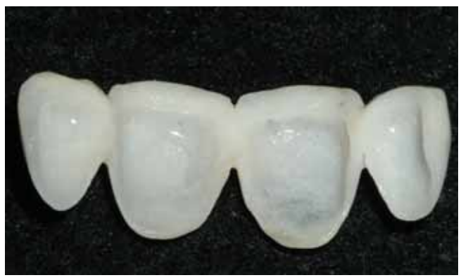
Figure 15: Bis-acryl temporaries with margins refined/relined with methylmethacrulate acrylic resin.

Whenever possible, cementation should be carried out under