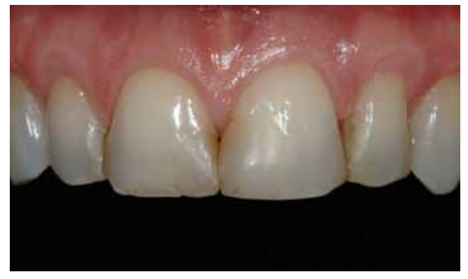
Figure 5: Post -periodontal surgery with root coverage (Dr Jonathan Lack)