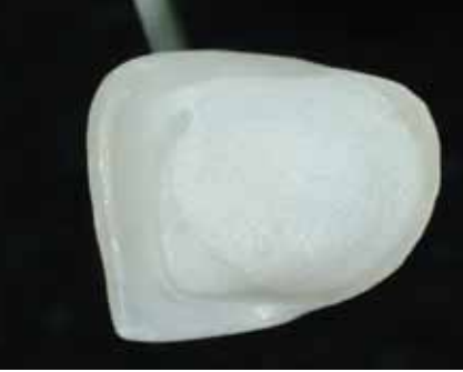
Figure 21: Clean frosty appearance of well etched porcelain