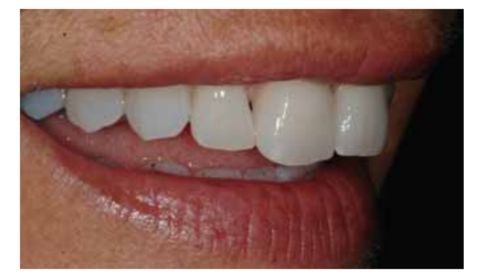
Figure 30: Post op appearance of smile

Magne P, Gallucci GO, Belser UC. Anatomic crown width/length ratios of unworn and worn maxillary teeth in