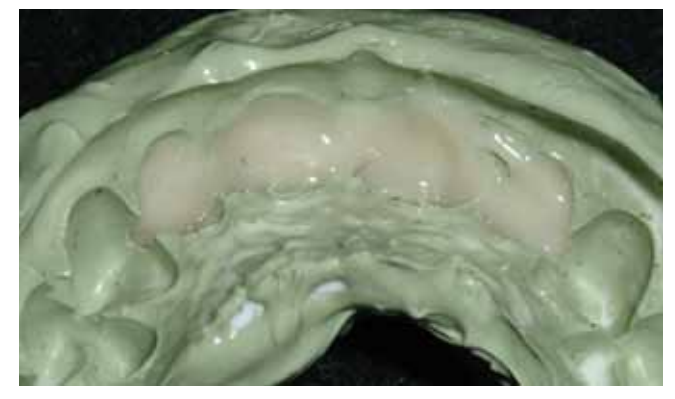
Figure 7: Bis-acryl resin in silicone matrix

Various techniques for accurate tooth reduction have been proposed, including silicone matrices, freehand preparation