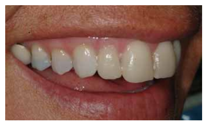
Figure 9: Bis-acryl mock up on teeth

and depth limiting burs (Cherukara et al, 2005). It is important