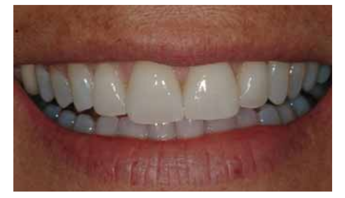
Figure 29: Post op appearance of smile