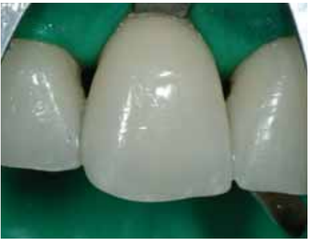
Figure 24: Bonded veneer in place. Note excellent Figure 25: Palatal fit of porcelain veneers visibility of margin due to rubber dam retraction.