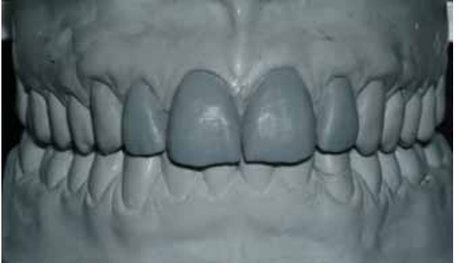
Figures 6a and b Original study casts compared to diagnostic wax-up

silicone matrices which would later be used for making an intra-oral diagnostic mock–up, a tooth preparation guide and the temporary veneers. An intra-oral mock up of the final proposed result was made using a Bis-acryl resin temporary resin material (PreVISION CB, Hereaus Kulzer) in a silicone matrix (Figure 7). Once the resin had polymerised, the matrix was removed and an aesthetic and functional analysis was made of the result (Gurel and Bichacho, 2006) (Figures 8-10).