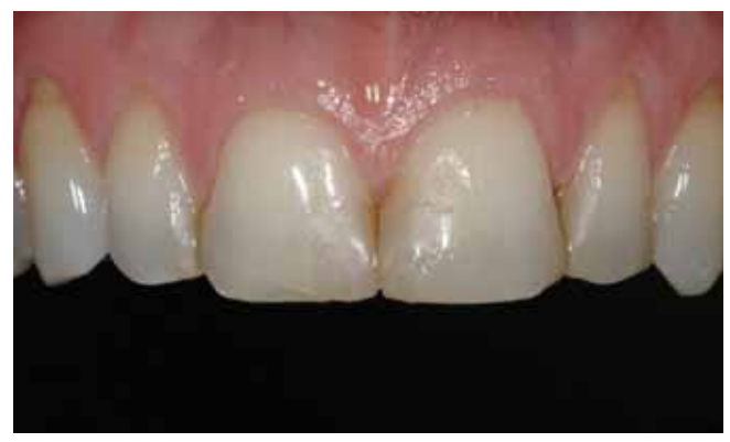
Figure 4: Gingival recession with exposed dentine. Note the large interproximal composite restorations on the four incisors