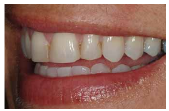
Figure 3. Pre-op smile