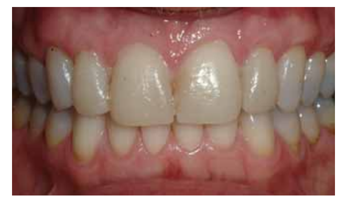
Figure 8: Bis-acryl mock up on teeth

Contact points were not preserved as the teeth had natural