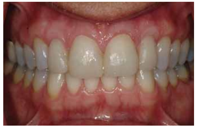
Figure 16: Temporary veneers cemented into place.

resin mechanical locks with a sharp instrument. The teeth were cleaned with pumice and the veneers were tried in. Contact points were adjusted and the marginal precision and fit were checked.