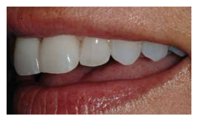
Figure 31: Post op appearance of smile

Pract Proced Aesthet Dent. 2006 Jun;18(5):281-6.