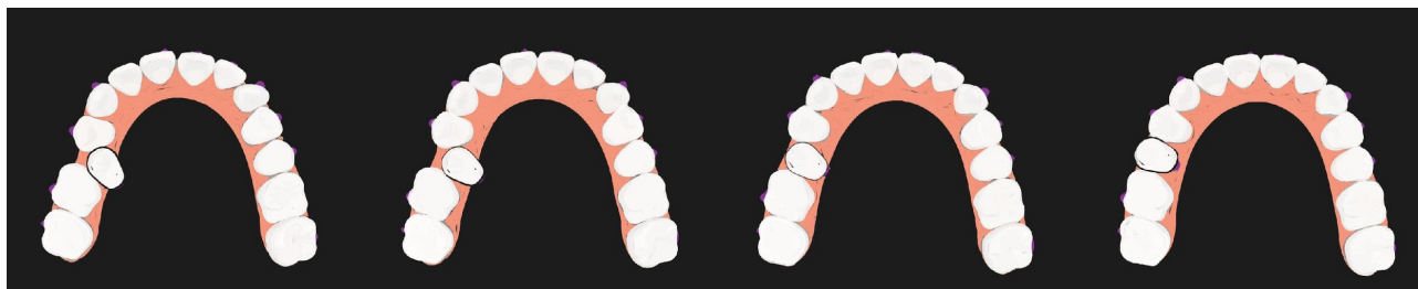
Figure 1 Shape driven system: tooth displacement as changing of aligner's shape

The mechanism of tooth movement using a clear aligner is classified into two systems. 5 There is the shape driven system (displacement system), where the shape of the plastic aligner is changed incrementally into each upcoming stage of tooth alignment to move each tooth into the designated position (Fig. 1).